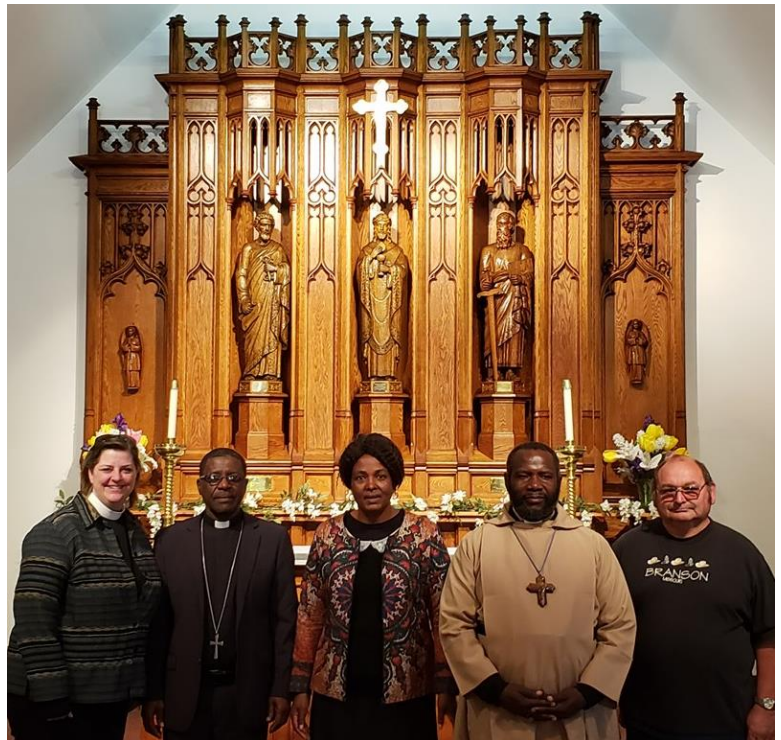
Visiting St. Paul's