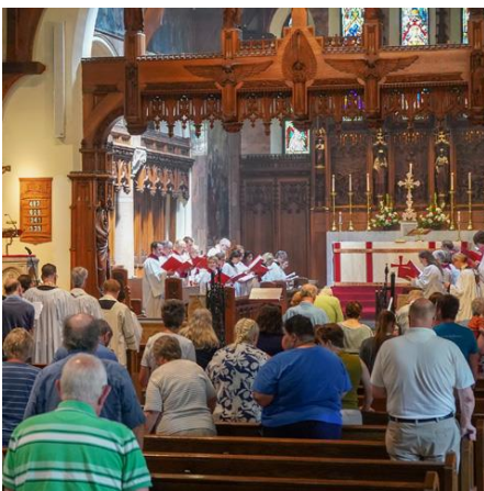
Eucharistic Fest – June 29