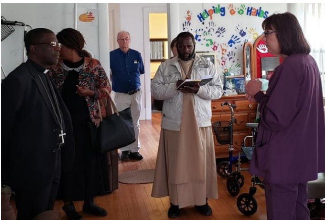
Visiting the Sharing Closet