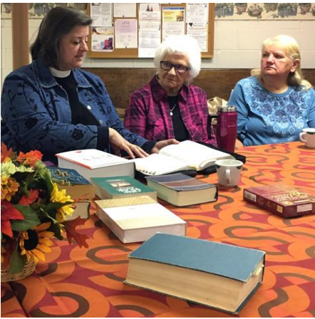
Adult Formation – The Kingdom of God